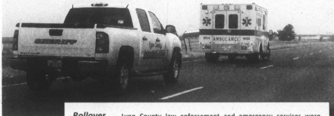
Rollover ... Lynn County law enforcement and emergency services were out in full force last Thursday when a winter ice storm descended on the area, responding to several traffic accidents, including this Suburban rollover (barely visible between the ambulance and sheriff's vehicle) on U.S. 87 just inside the FM 400 overpass north of Tahoka. The roads were extremely slick with black ice on Thursday, with traffic slowing to a crawl throughout the morning.

Charges bringing the latest arrests included possession of marijuana, possession of drug paraphernalia, parole violation, and an application to revoke probation on conviction of driving while intoxicated second offense or more.