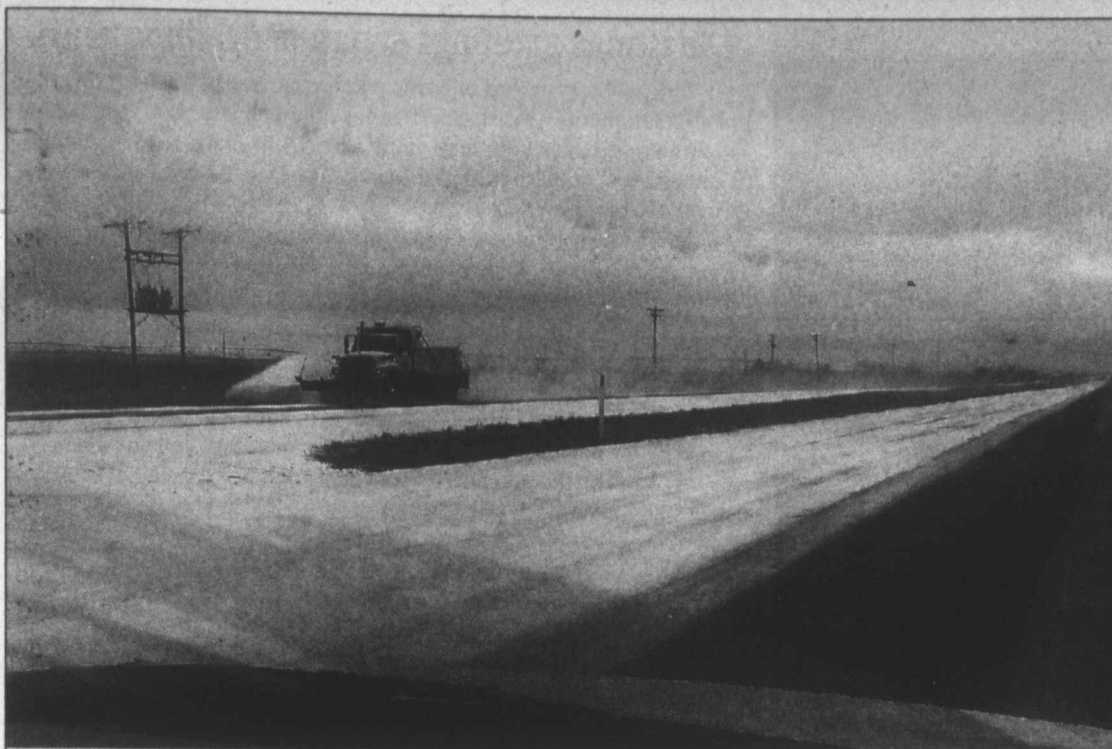
Snowplow on US 87 ... TxDOT was kept busy this past weekend when another winter ice storm hit the South Plains area, causing dangerous driving conditions last Thursday and continuing through the weekend with extremely cold temperatures. This snowplow was clearing highway lanes between Tahoka and Lubbock.