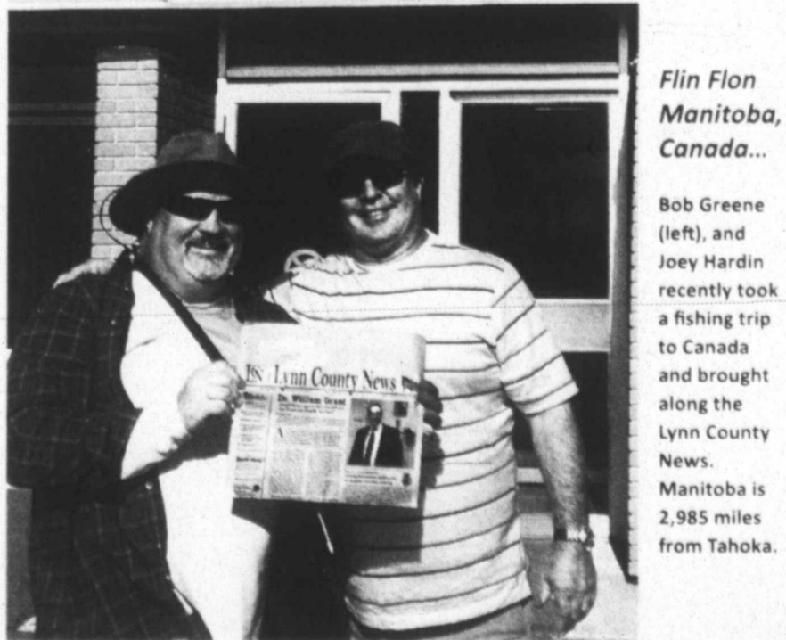
Flin Flon Manitoba, Canada...

Welcome to OUR FRIENDLY CITY OF FLIN FLON