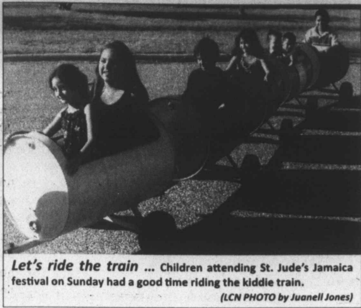
Let's ride the train... Children attending St. Jude's Jamaica festival on Sunday had a good time riding the kiddie train.