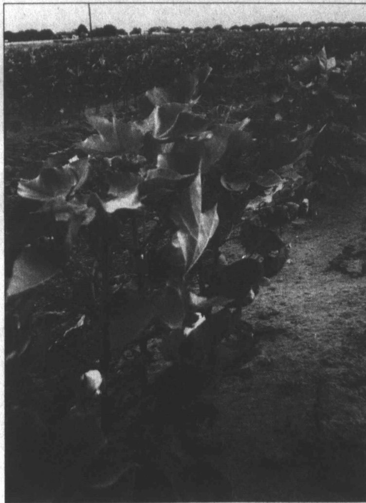
Growing season ... This photo of irrigated cotton was taken just east of T-Bar Country Club golf course. Dryland cotton is taking a harder hit, although some much-needed rain fell Monday night and Tuesday in the area.