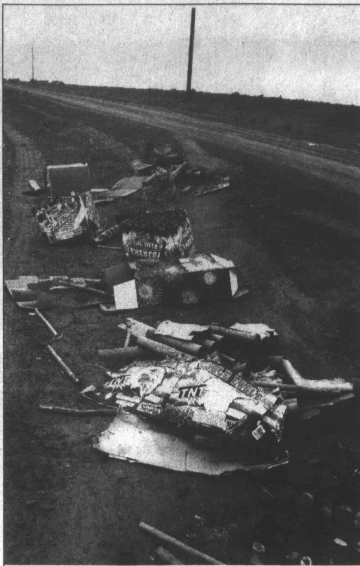
The aftermath ... There is no excuse for the fireworks trash left on rural roads, such as this mess left on the side of a road northeast of T-Bar Country Club, after the July 4th fireworks celebrations. Debris like this can be found on many of the rural roads just outside Tahoka's city limits, and left untended blows into adjacent cotton fields, creating problems for landowners. Be considerate - return to the scene of your fireworks fun to pick up your trash.

For more information on the event, contact the library at 561-4050.