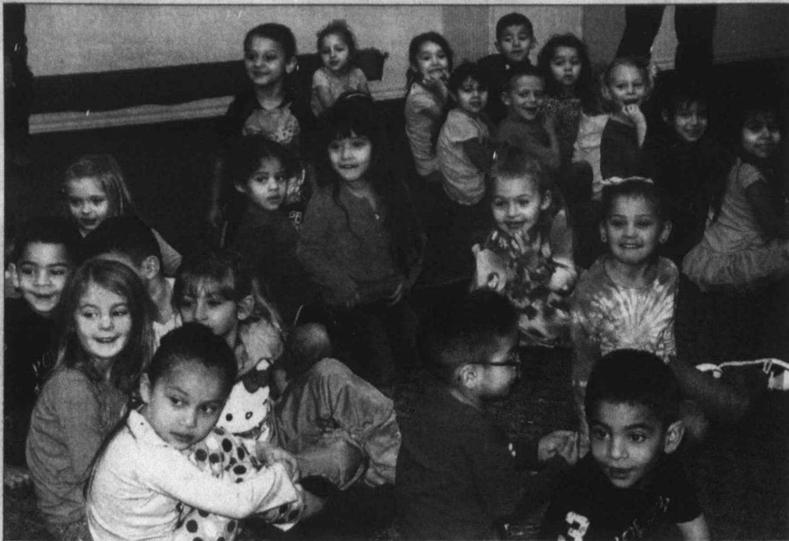
Here comes Santa Claus!... Their faces lit up with excitement as these little ones spied Santa and Mrs. Claus coming to visit at the children's Christmas story time at the City/County Library Tuesday morning. Each had an opportunity to visit with Santa and tell him what they wanted for Christmas.