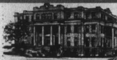
Courthouse built in 1916