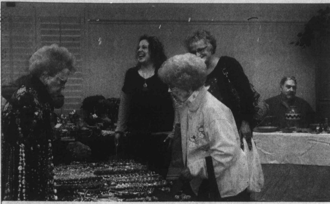
Merry shoppers... The annual local Christmas Craft Show was held Dec. 3rd at the Life Enrichment Center in Tahoka. Several shoppers braved the cold morning to shop for that special gift for Christmas. The event was a great success, according to organizers.