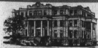
Courthouse built in 1915