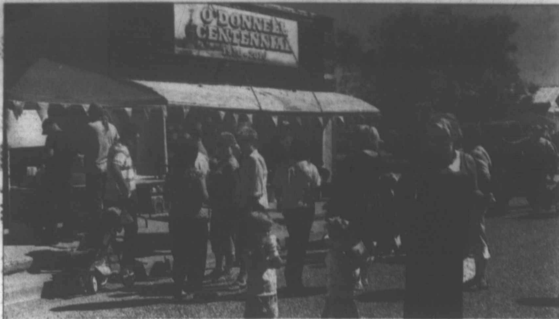
Centennial Celebration ... Lots of folks gathered at O'Donnell Saturday for their Centennial Celebration and Cotton Festival. The event started with a parade, followed by an all-day celebration including booths of all kinds, an afternoon program featuring each decade in the past 100 years, and a street dance to close the day's fun.