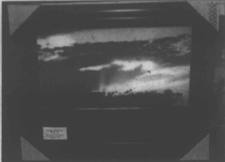
Local scene... This photo was taken north of Tahoka of a sunset over a cotton field, and is available at the City-County Library's Silent Auction on Saturday at the Harvest Festival. The library will accept donations of auction items up until 9 a.m. Saturday, with all proceeds benefitting the local library.

Lunch Monday: Pizza, corn, salad, sliced peaches Tuesday: Oven crisy chicken, mashed potatoes, gravy, green beans, roll, gelatin Wednesday: Nachos grande, lettuce & tomato, cornbread, orange smiles Thursday: Corn dog, oven fried potatoes, broccoli w/ ranch, apple Friday: Hamburger w/ trimmings, carrots w/ ranch, chocolate pudding cup