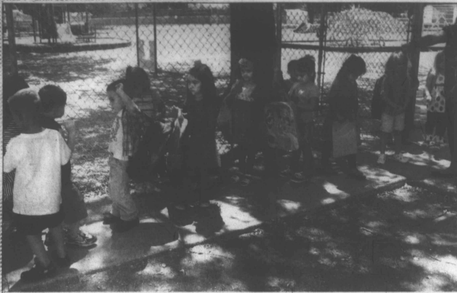
Can we go home now? ... Tahoka Elementary pre-kindergarten students line up outside at the end of their first day of school, ready to greet their parents after a long day away from home.