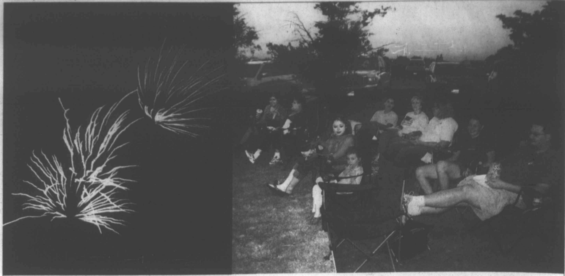
Ready for fireworks ... Lots of folks brought lawn chairs and visited while waiting for the fireworks show that started about 9:45 p.m. at the Wilson City Park last Saturday, hosted by St. Paul Lutheran Church. The Independence Day fireworks show was finally held on Aug. 7, after three rain delays.