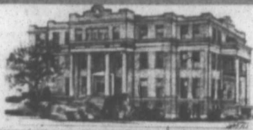
Courthouse built in 1916