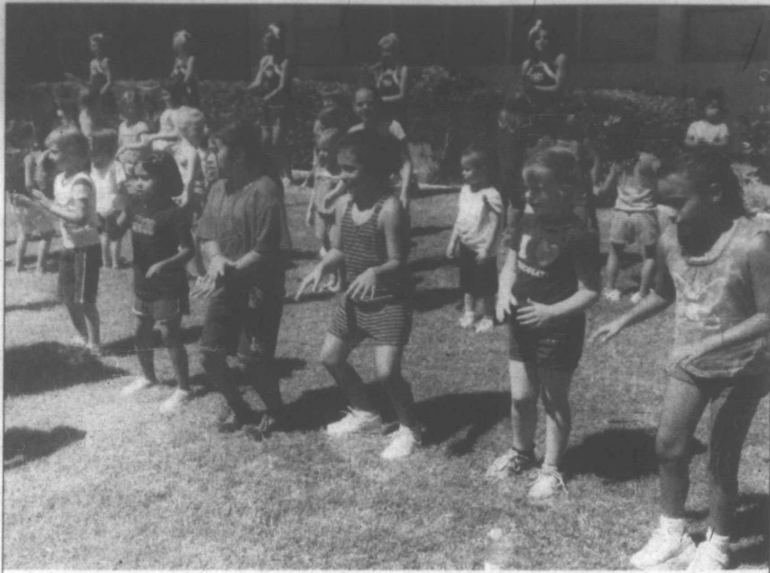
Lots of cheering... These girls are having fun learning how to cheer at the Tahoka High School Varsity Cheer Clinic held this week at the school.

Get your stories and ads in by 12 NOON on Tuesdays at The Lynn County News LynnCoNews@poka.com Phone: 806-561-4888