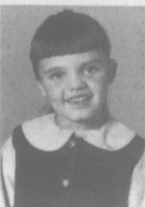
Happy Birthday We love you -- your family.