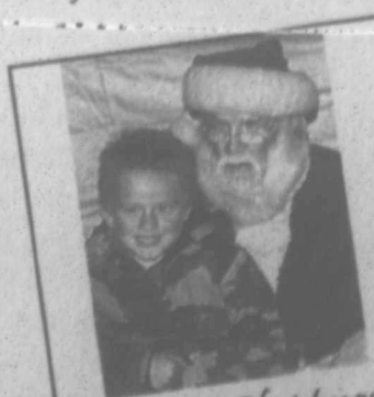
Merry Christmas from Santa and the Somebody family!