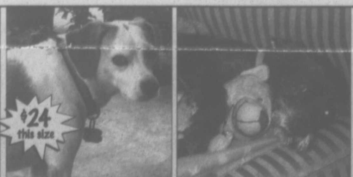
All we want for Christmas is some new toys!