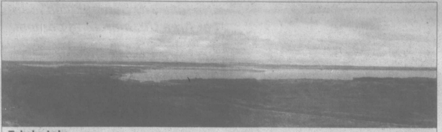
Tahoka Lake ... Pictured here is a portion of Tahoka Lake, a historical site from which the town of Tahoka originated, getting its name from the lake named by Indians in the 1800s. In December of 1902, a group of settlers gathered near Tahoka Lake to discuss organizing the county and establishing a county seat. The Lynn County Historical Society hosted a tour of the lakesite Saturday, with archeological and wildlife experts providing insight to the history preserved there.