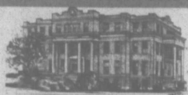
Courthouse built in 1915