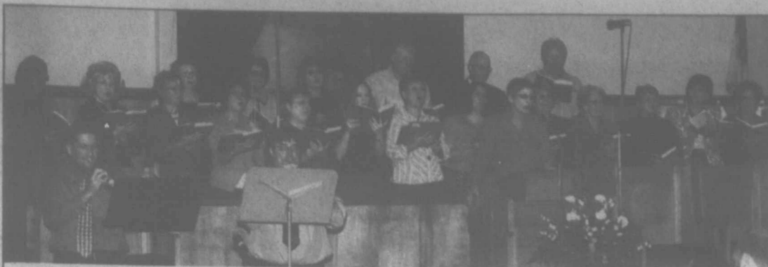
Celebrating 95 years... First Baptist Church in Wilson celebrated their 95th Anniversary on Sunday, October 18, 2009. Several former pastors spoke at the services and former members sang specials during the celebration. Pictured here are members of the choir who sang during the services.

Funeral services were held at 10:00 a.m. on Wednesday, October 21, 2009, at Our Lady of the Lake Church in Brownwood, Texas.