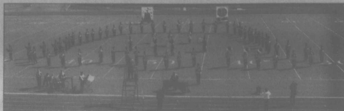
Band performs at Regional contest ... The Tahoka High School 3-D Band scored all 1's in the Region 16 UIL Marching Contest last Saturday in Lubbock. They will march in the Area A Marching Contest this Saturday, Oct. 24, at Lowery Field in Lubbock, for a chance to advance to the State Marching Contest in November.