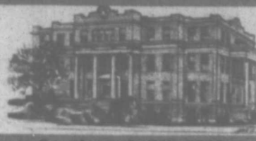
Courthouse built in 1916