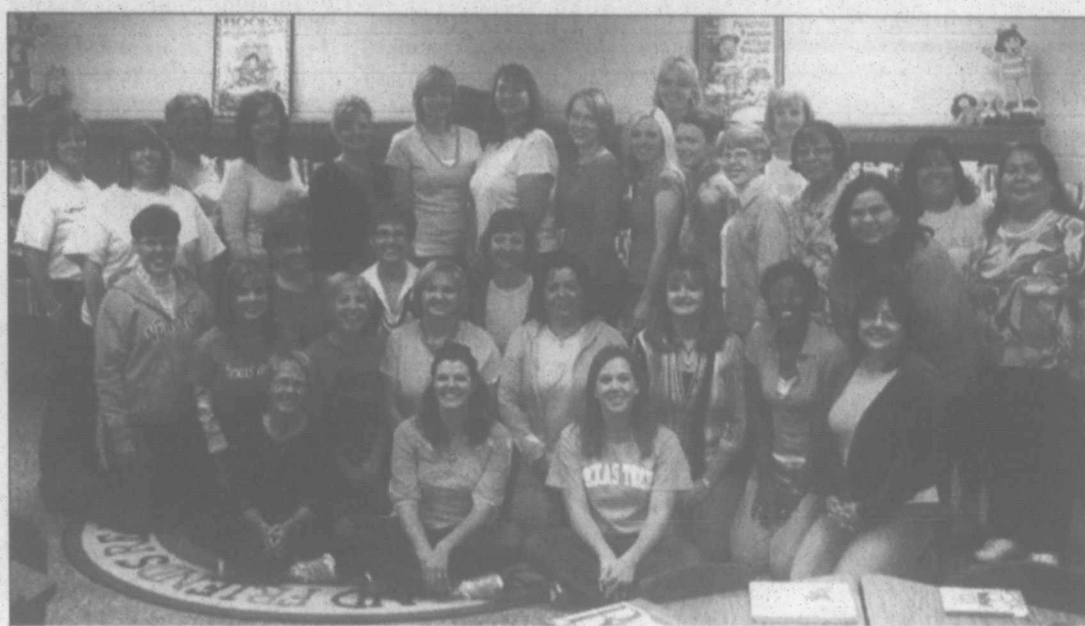
Dressed in pink ... The Tahoka Elementary staff wore pink shirts (although it is hard to tell in this black and white photo) to school during October to school to show support during Breast Cancer Awareness Month.