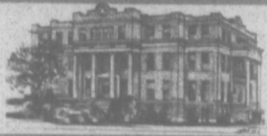
Courthouse built in 1916