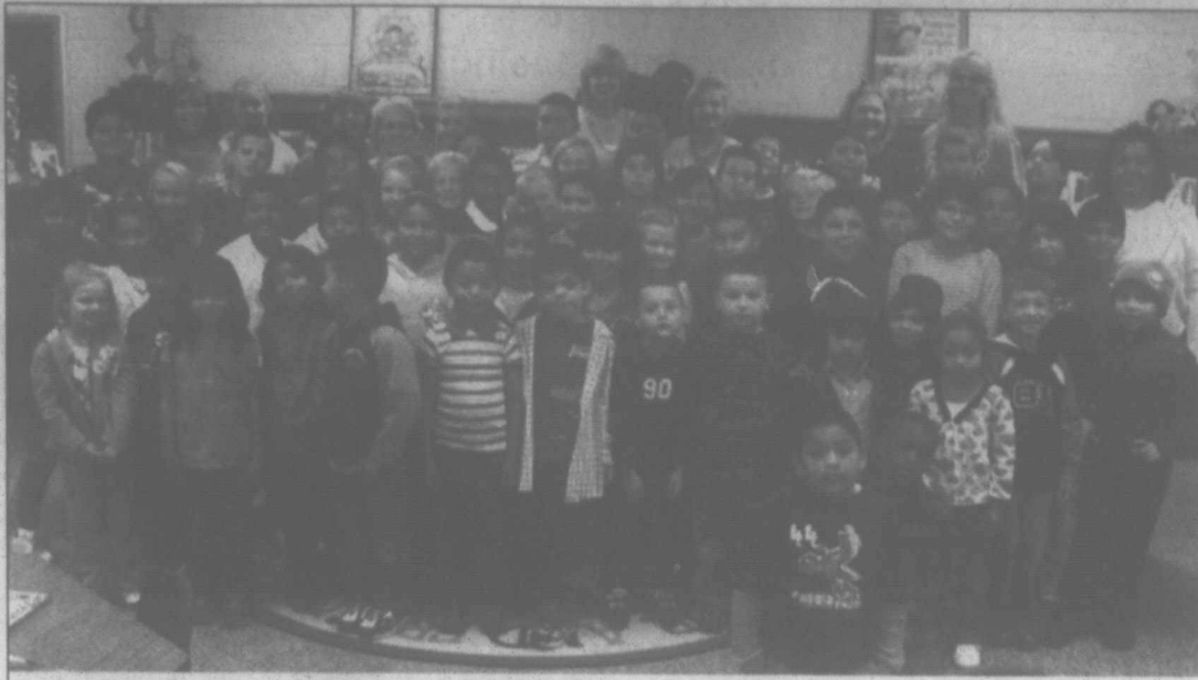
We walked to school ... Tahoka Elementary students and staff pictured here walked to school on Oct. 7, National Walk To School Day.