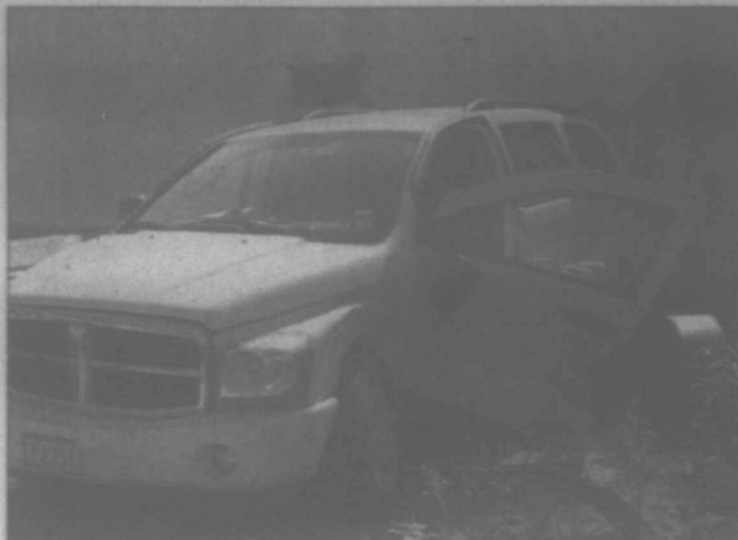
Saturday smashup... The two vehicles shown here, a Dodge Durango and a Ford Fusion, were involved in a collision Saturday at FM 1053 and U.S. 87 at O'Donnell. The severity of injuries to persons involved was not immediately known.