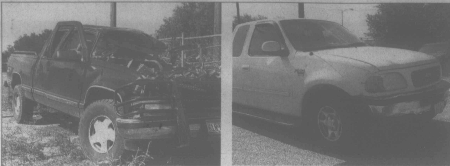
No serious injuries... The driver of the Chevrolet pickup in the left photo was treated for apparently non-serious injury after the pickup collided with a plow being pulled by a tractor on FM 2053 east of O'Donnell Monday evening. The white Ford pickup in the other photo also struck the plow, but neither that driver nor the man on the tractor was seriously hurt, although both were treated at hospital emergency rooms.