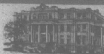
Courthouse built in 1910