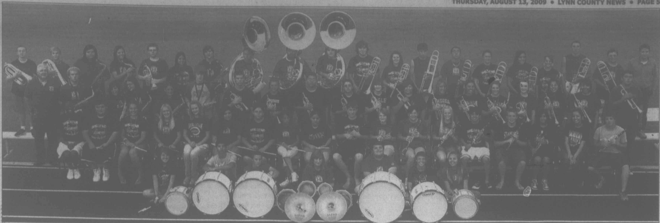
Hard at work ... the Tahoka High School Band has been busy practicing for the upcoming football season. They will perform for the home crowd for the first time this year on August 28th at halftime.