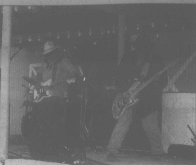
Good time at the music festival and chili cook-off ... Lots of RVs were parked at the site of the annual Chili Cook-off and Music Festival held last weekend in Tahoka. Shown here, some of the crowd gathers in front of the stage to listen to one of several bands who entertained during the two-day event.