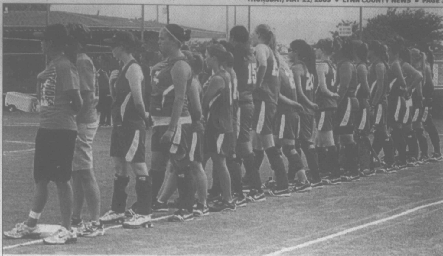
Ready to play... The Tahoka Lady Bulldogs softball team stands at attention during the playing of the national anthem prior to their Area match against Marfa in Midland last Friday. Marfa won 4-1.

Buy Office Supplies at The Lynn County News