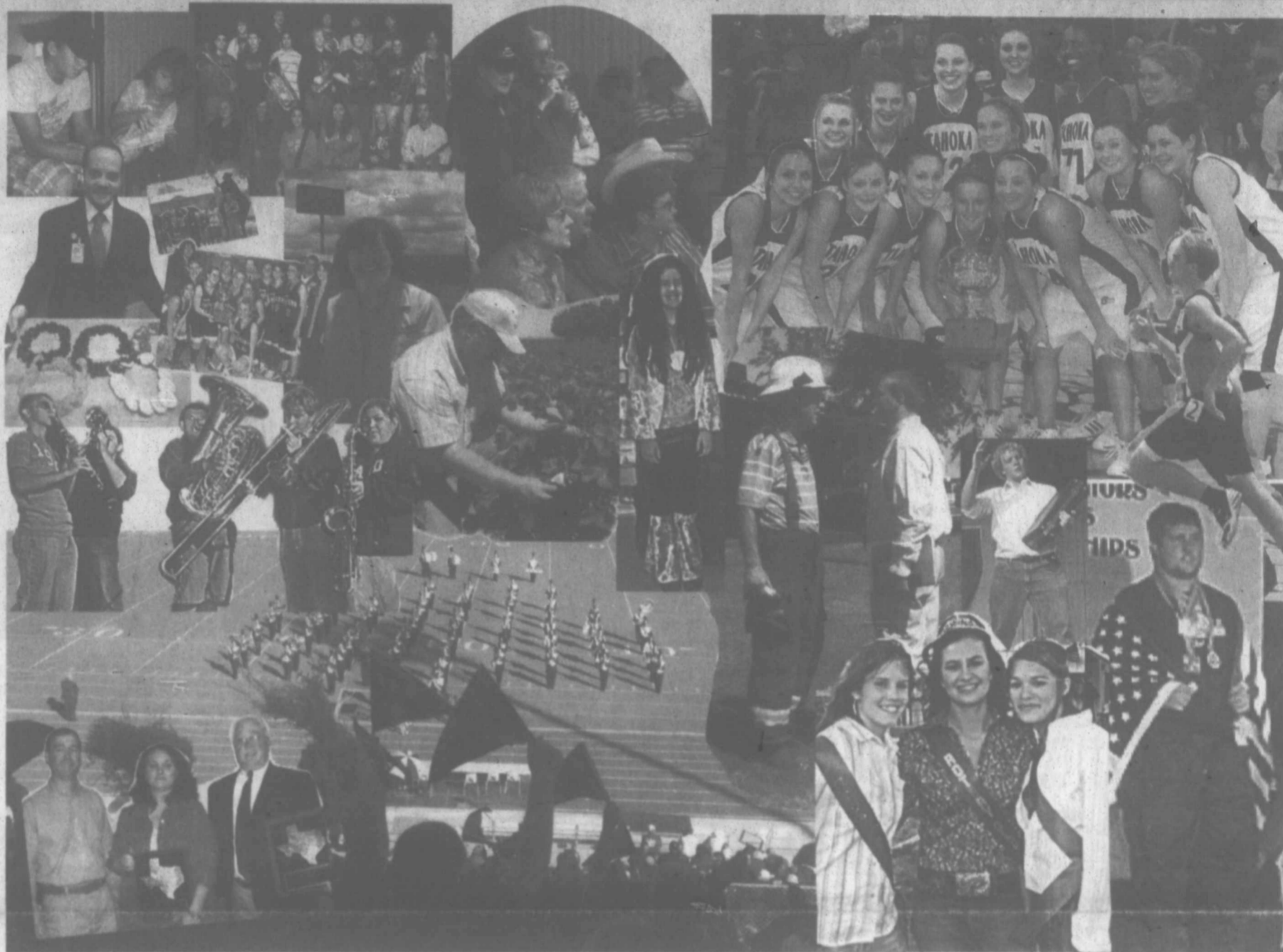
Goodbye, 2008 ... It's the end of 2008, and shown here are just a few of the faces from the pages of The Lynn County News issues during the past year. We hope the past year was a good one for you, and wish peace and prosperity for you in 2009.