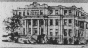
Courthouse built in 1916