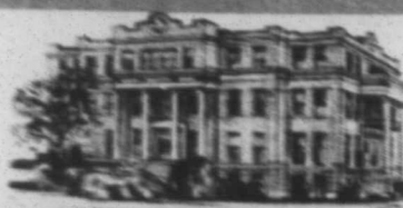
Courthouse built in 1916