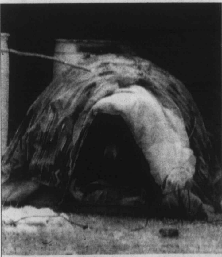
Bear in hibernation? He looks a little like a bear in a cave, but this large dog was snug in his igloo dog house, complete with blanket thrown over the top for extra insulation, during subfreezing temperatures over the weekend. He eyed the Lynn County News photographer, but did not venture out into the cold on Sunday afternoon when this picture was taken, in south Tahoka.