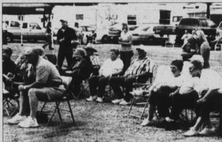
Hear The Music Play... A crowd gathers at the End of the Trail RV Park in Tahoka this past weekend to hear live performances of bands from around the area and to watch some of the Bar-B-Que/Chili Cookoff competition. Barbecue brisket plates were also available, and other concession items.