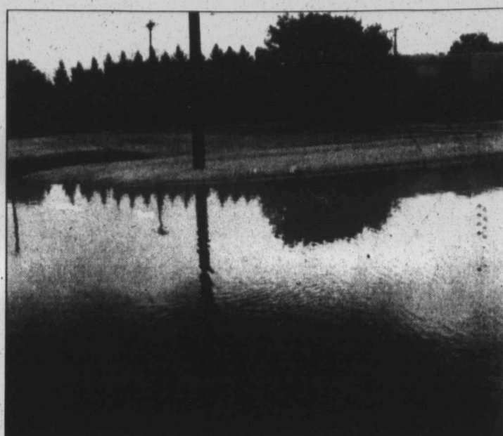
And The Rains Came ... Late afternoon showers about 4:15 p.m. produced flooding in some areas across the city on Friday. Water was across the road at this intersection of Lockwood and Ave S. The official rain total was 2.29 inches that fell in only 45 minutes.

A Gift to the AMERICAN CANCER SOCIETY MEMORIAL PROGRAM strikes a blow against cancer