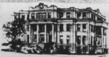
Courthouse built in 1916