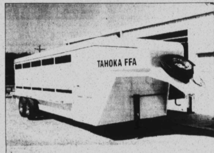
Ag Classes Build Trailer ... Three Tahoka High School Agriculture classes built this 24-foot gooseneck trailer during the spring semester (see story).