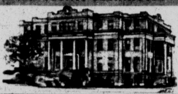
Courthouse built in 1916