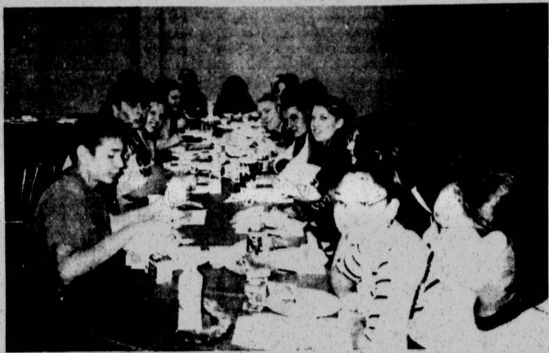
FUN AT THE ROUND TABLE MEETING - New Home Home School students met May 17 for a Round Table Meeting focusing on Red Ribbon Week.