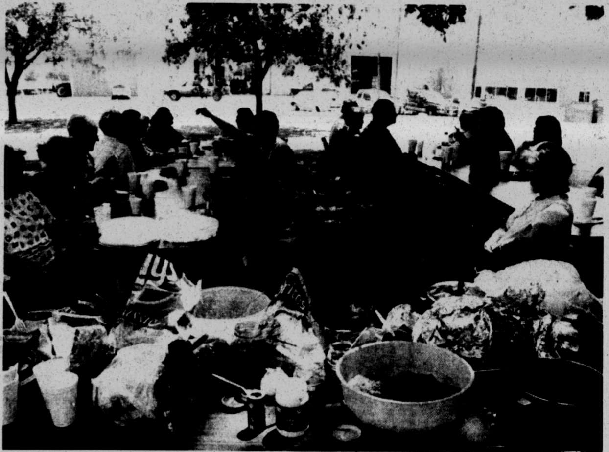
A FINE DAY FOR A PICNIC - Lynn County Courthouse employees and some of their family members gathered under the trees of the courthouse Friday for a noon picnic, to enjoy the fine weather and take a break from their busy schedules. This is the second annual picnic for the county group, who brought lots of homemade goodies to supplement the meat provided by the Probation Office.