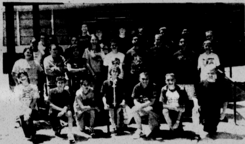
BAND FESTIVAL HONORS — Both Tahoka Middle School Bands, the Symphonic Band (photo above) and the Concert Band (shown below), earned F's in Concert and Sightreading, a small Sweepstakes, at the Floydada Band Festival last week.