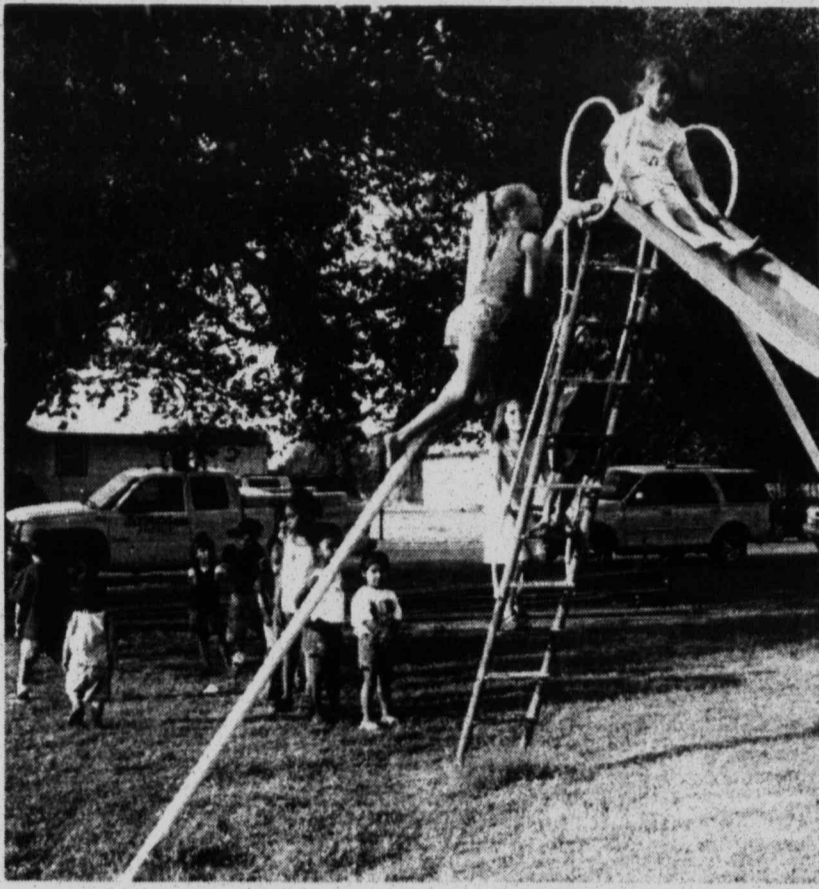
PLAY TIME - Children lined up for their turn on the slide at the Tahoka Elementary playground Tuesday night during Back-To-School night activities. Students and their families found their classrooms and met teachers before heading outside to the carnival hosted by Tahoka Pride Corp. (LCN PHOTO)