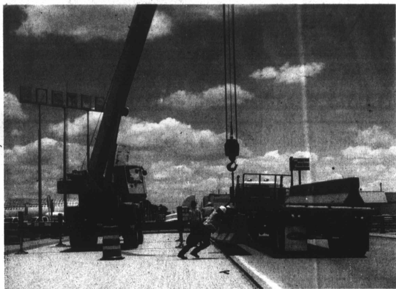
WORKING HARD - Construction crews place concrete traffic barriers on the Hwy. 380 bridge in Tahoka Monday, to prevent traffic from veering into construction areas as repair work continues for the next couple of months.