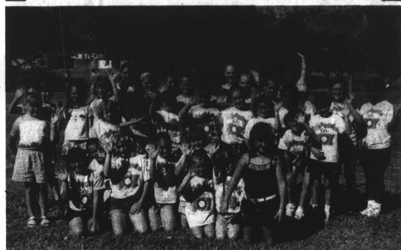
CAMP IS FUN! - These girls from Tahoka give a cheerful wave from GA Camp at Plains Baptist Assembly in Floydada, June 18-21. Sponsored by First Baptist Church of Tahoka, the girls look like they had lots of fun at the camp.