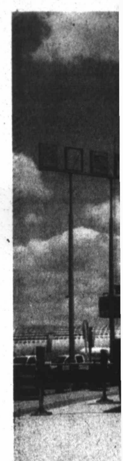
WORKING HARD Monday, to prevent of months.