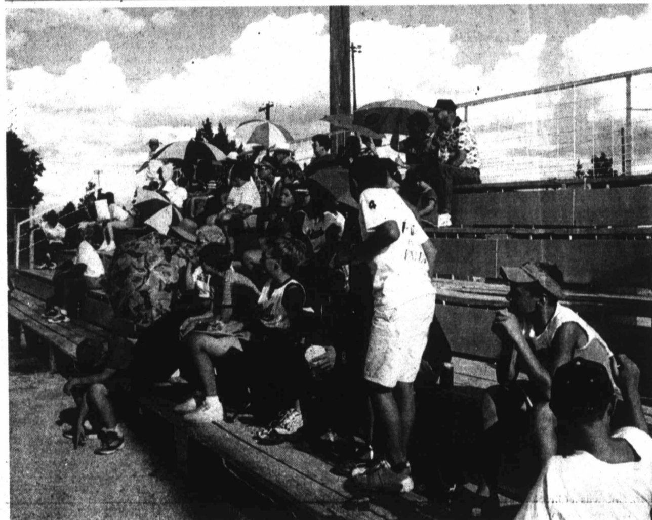
ENJOYING THE GAME - The stands were full of people and umbrellas under the hot sun Monday evening, cheering for their respective teams at the 9-10 year old All-Star Baseball Tournament in Tahoka. Here, O'Donnell fans watch their team take on Roosevelt All-Stars.