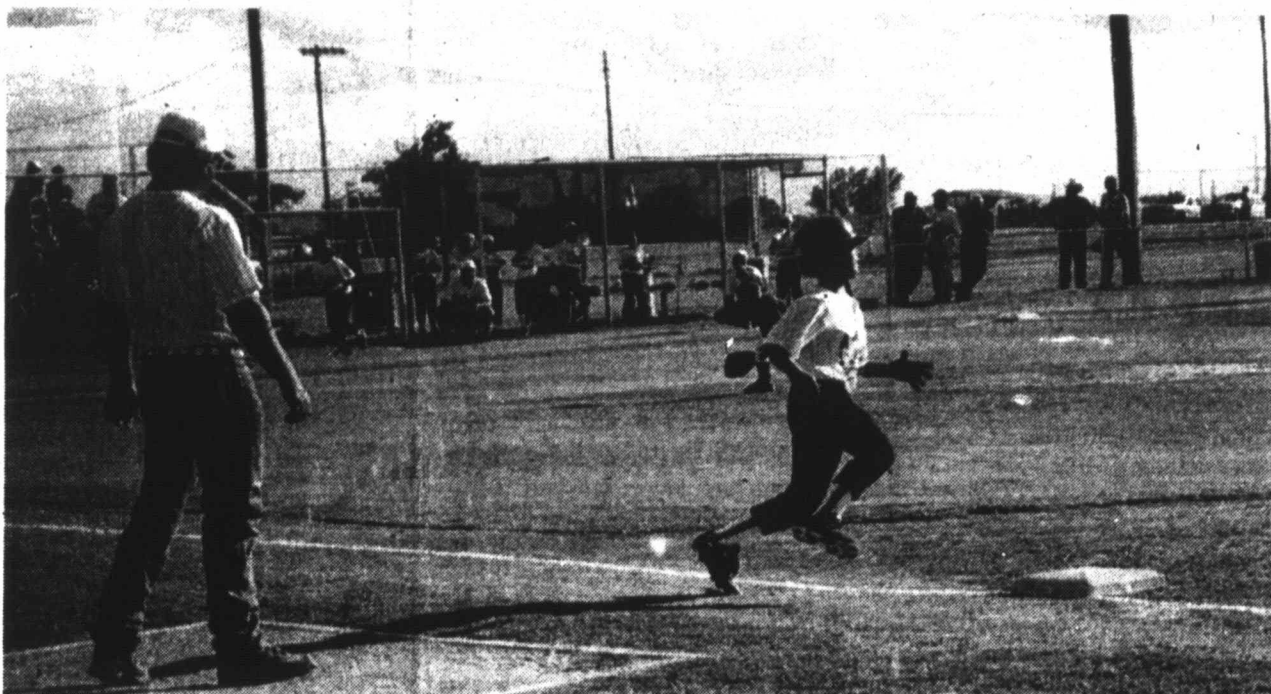
BASELINE RUN - An O'Donnell All-Star player is full speed ahead as he rounds first base in a game against Roosevelt All-Stars here Monday night. Tahoka hosted the 9-10 year old All-Star Baseball Tournament from Saturday to Saturday, with teams from Tahoka, Post, Roosevelt, Cooper, Lamesa, O'Donnell and Floydada participating. Games continue Tuesday, Thursday and Friday at 7 p.m., with a Saturday night game scheduled if needed to close the tournament.

And in O'Donnell, the annual July 4th Celebration in the park will be held, with food booths, music, fun and games. Performances include the Merricks band, community choir and elementary students.