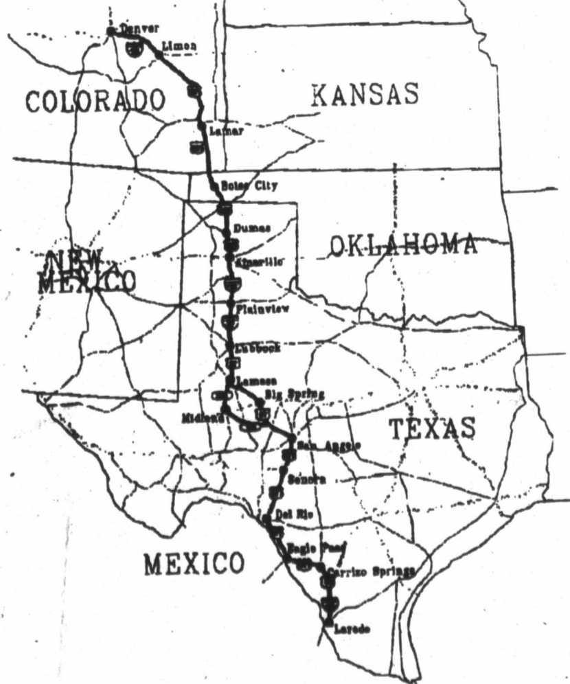
PORTS TO PLAINS ROUTE - Traffic will go through Tahoka and O'Donnell (Hwy. 87) on the newly designated route for the Ports to Plains international trade corridor. Estimated to take 20 years to complete, the Ports to Plains Corridor will link the Texas/Mexico border to Denver, Colo.

While no funding has been set aside for construction, development plans include upgrading the existing route to a four-lane divided highway. The estimated cost for these improve-