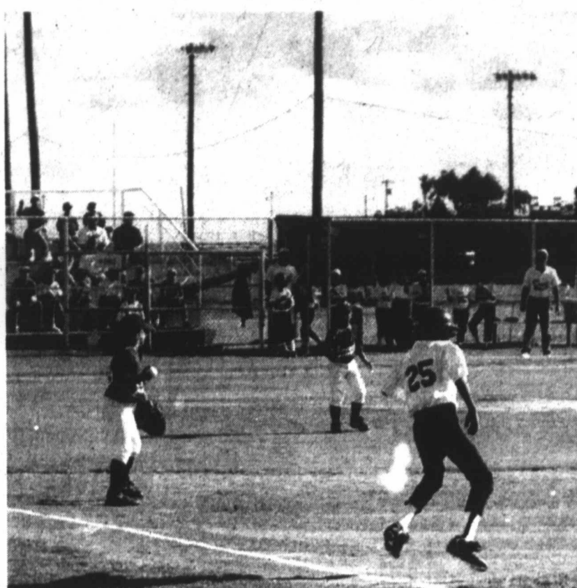
MIDAIR LEAP - An O'Donnell All-Star player (#25) is caught midair as he heads for first base in the O'Donnell-Roosevelt game Monday night. Roosevelt won the game 8-6, and in the second game of the night Lamesa squeaked by Post 12-11.

Registration for the second summer term at South Plains College's locations in Levelland and the Reese Center will be from 3-6 p.m. Monday, July 9. Registration will be in the Administration Building on the Levelland campus and Building 1, Administrative Offices at Reese Center. More than 100 courses, from Anatomy and Physiology II to World Literature I, will be offered, including 10 internet courses. Late registration is Tuesday and Wednesday, July 10-11 from 8:30 a.m. to 3:30 p.m. and 5:30 to 6:30 p.m. on the Levelland campus and from 5 to 7 p.m. at the Reese Center. A late fee of $15 and a $5 add/drop fee will be charged. Classes begin July 10 at both locations.