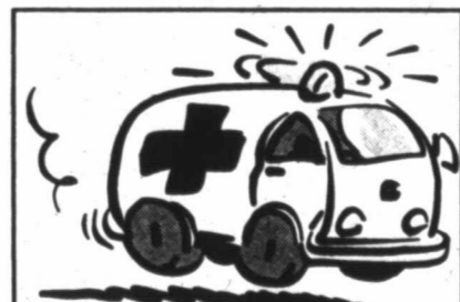
Anyone may donate to the Lynn County EMS Memorial Fund at the Lynn County Hospital office. Lynn County EMS is currently raising funds for the purchase of a new ambulance.

With more than 100,000 members, ATPE is the largest educator group in Texas. Its membership consists primarily of classroom teachers, but also includes paraprofessionals, administrators, college students and retired educators.