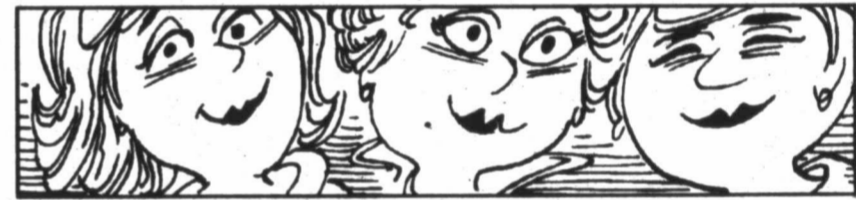
From 1986 to 1988, the Emmy for Best Actress in a comedy went to a cast member of The Golden Girls (Betty White, Rue McClanahan and Beatrice Arthur.)