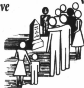
Come share the Spirit!

We believe that those who suffer can be consoled through the love of God and God's family.