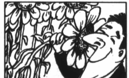
Kansas is also known as the Sunflower State:

Available at the City/County Library, located inside the Life Enrichment Center, 1717 Main Street, Tahoka, phone 998-4050. Open Mon. and Wed. 9 a.m.-5:30 p.m. (closed 12:30-1:30 p.m. for lunch), Tues. and Thurs. 2-7 p.m. and Saturdays 10 a.m.-1 p.m.