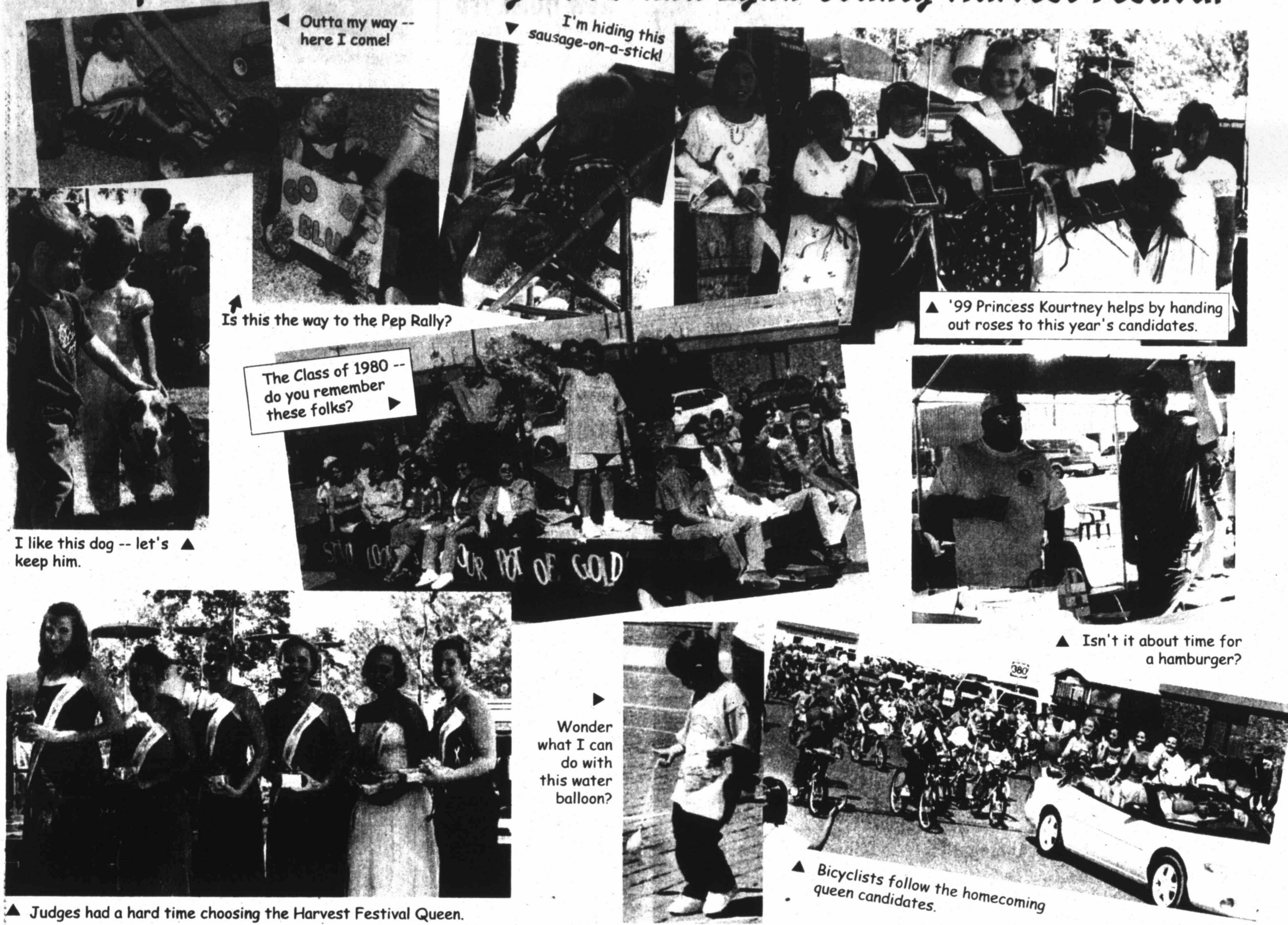
Outta my way -- here I come!