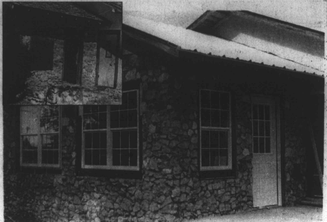
BIG IMPROVEMENT - This house in the 2100 block of North 4th Street is undergoing some major improvements by owners, as new windows and doors, new roof, and refurbishing of the interior is underway. Why is that news? Because this was one of the properties declared condemned by city officials in early September (see inset). The house, located across the street from the north Tahoka Elementary playground, was one of several condemned properties which city officials were concerned not only looked bad but provided places for illegal drug activity. The renovation project is a welcome sight for the area.

According to folk legend, a 12-foot-long upturned shell of a 600-pound snapping turtle served as Davy Crockett's cradle when he was an infant.