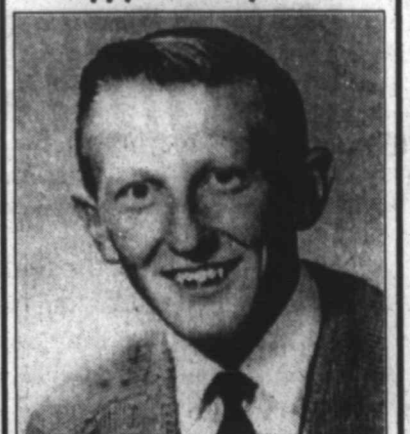
from The West Point Gang