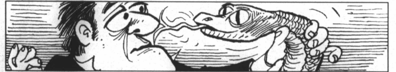
The shape of a reptile's pupil indicates whether the animal is active at night or during the day. Reptiles active at night have slitlike pupils to help them see in the dark, while those active in the day have round pupils.