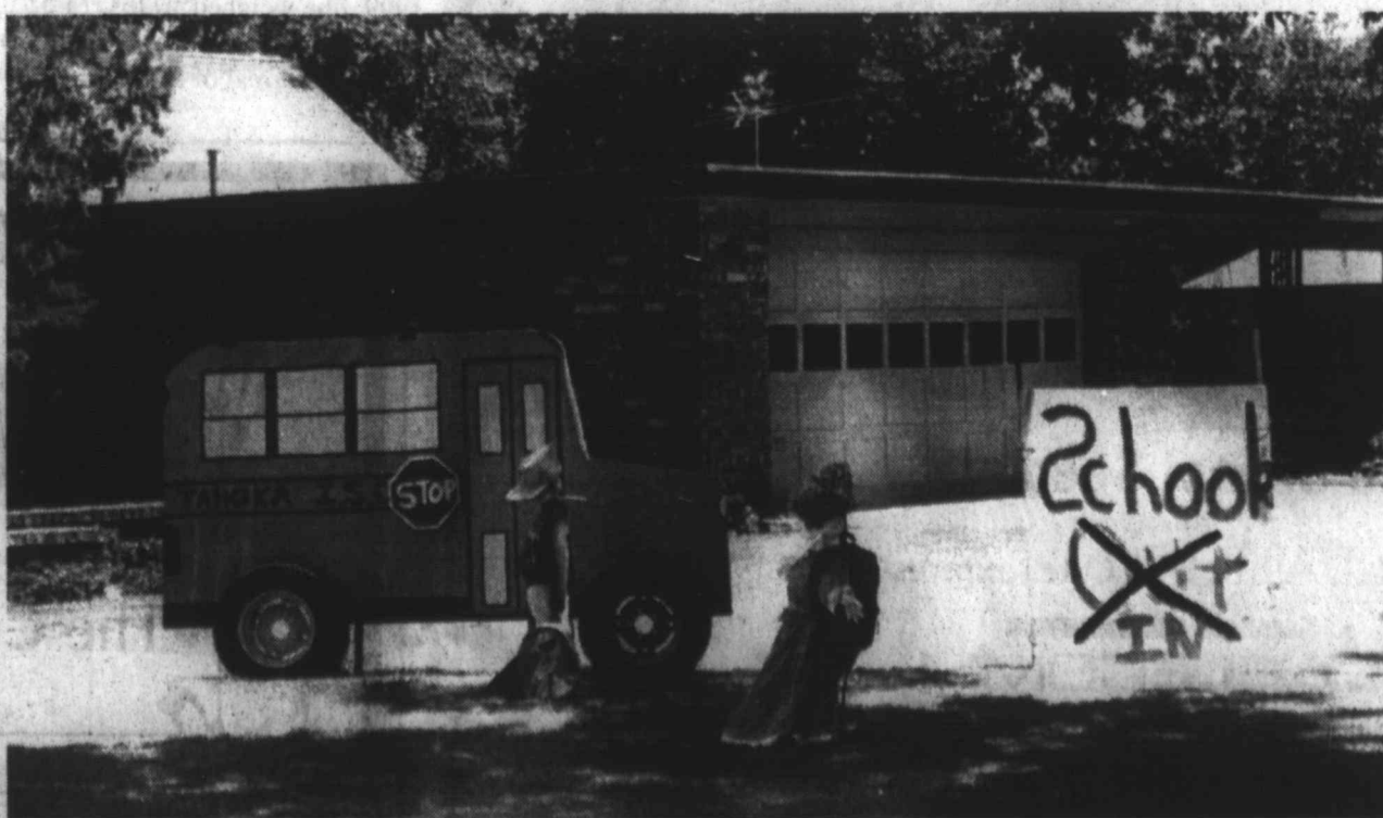
THE BUS STOPS HERE – This scene in the yard at N. 2nd and Ave. L in Tahoka depicts students with backpacks preparing to get on board the school bus. Students in Tahoka return to class Monday, while Wilson and New Home students begin today (Thursday). Area motorists are reminded to be watchful of children crossing streets, and to obey school traffic signs and speed limits.

Parents of these students are asked to bring a freezer of ice cream. The booster club will provide cups, spoons, etc.