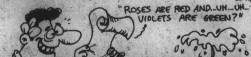
The ancient Greeks believed that anyone who drank from the fountain of Castalia on Mount Parnassus would be able to write poetry.