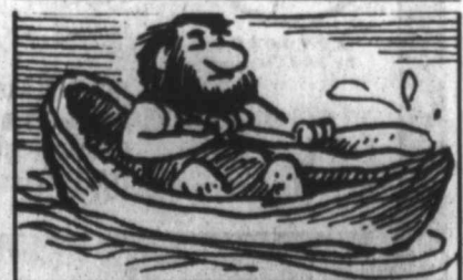
The earliest surviving "vessel" is a pinewood dugout found in Pesse, Netherlands, and thought to date back to about 6315 B.C.

Several people have asked about a school supply list for the upcoming school year. School officials report that they are working on them and hope to have them available within the next few weeks.