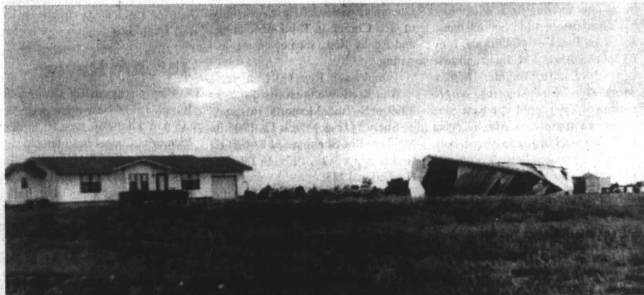
A metal structure was blown away near a home about a half mile west of US 87 seven miles south of Tahoka.