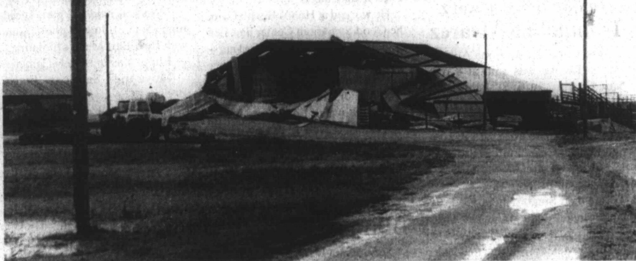
A large barn owned by Bill Griffing 4 miles south of Tahoka suffered heavy damage, with most of the roof blown off.