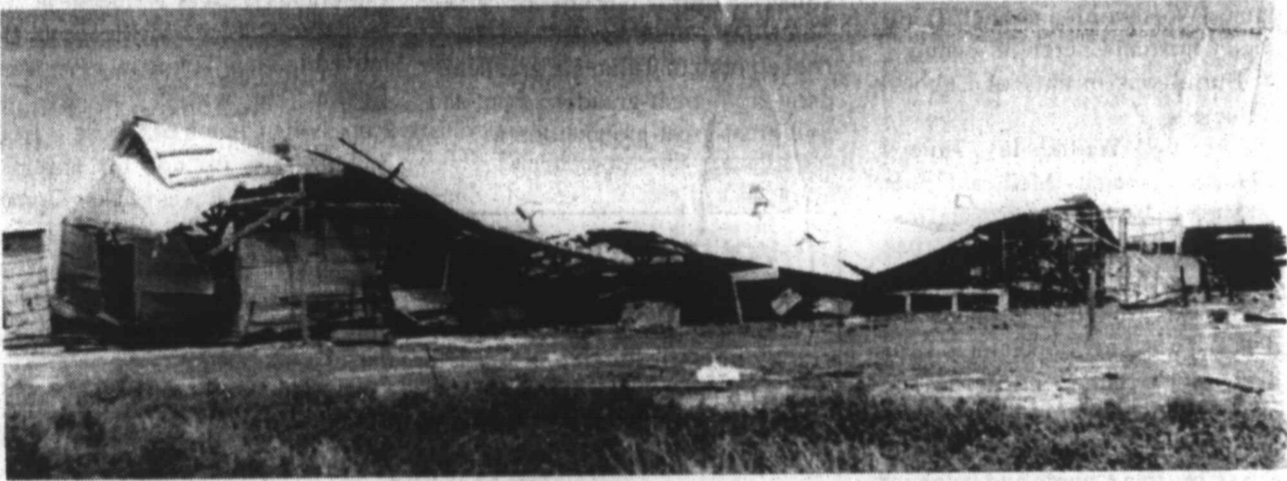
Just west of US 87 intersection with FM 3522 south of Tahoka, this barn/storage building was damaged by last week's storm.