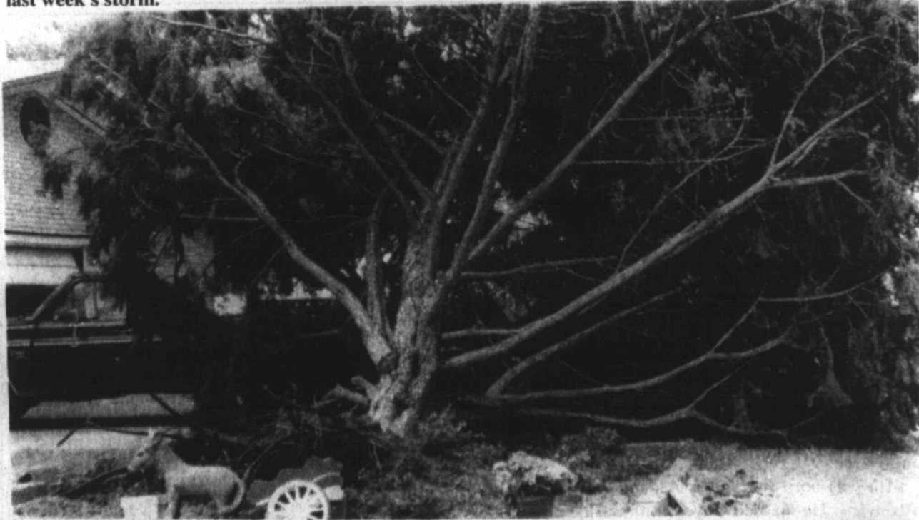
A tree was uprooted at this O'Donnell home a half mile east of US 87 on FM 2053.