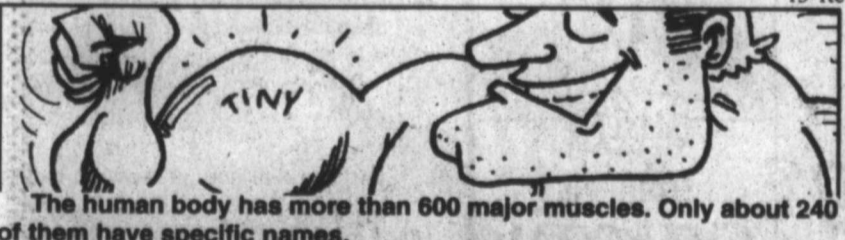
The human body has more than 600 major muscles. Only about 240 of them have specific names.

Bookkeeping and Income Tax Service Provider for AgriPlan - BizPlan 628-6368 1206 Lumen Ave. • P.O. Box 21 Wilson, Texas 79381