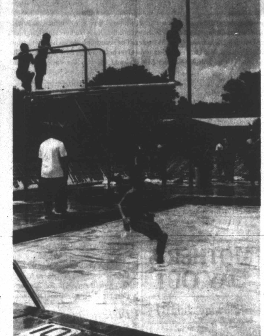
COOL SUMMER FUN - Area youth have enjoyed the Tahoka City Pool during these hot summer months, cooling off in the 90+ degree weather. This photo, taken earlier this summer, shows one girl contemplating her jump from the high diving board, and the boy who just leaped from the low diving board looks like he is sitting in mid-air.