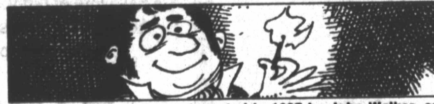
The friction match was invented in 1827 by John Walker, an Englishman.

Lynn County Merchants Appreciate Your Business!