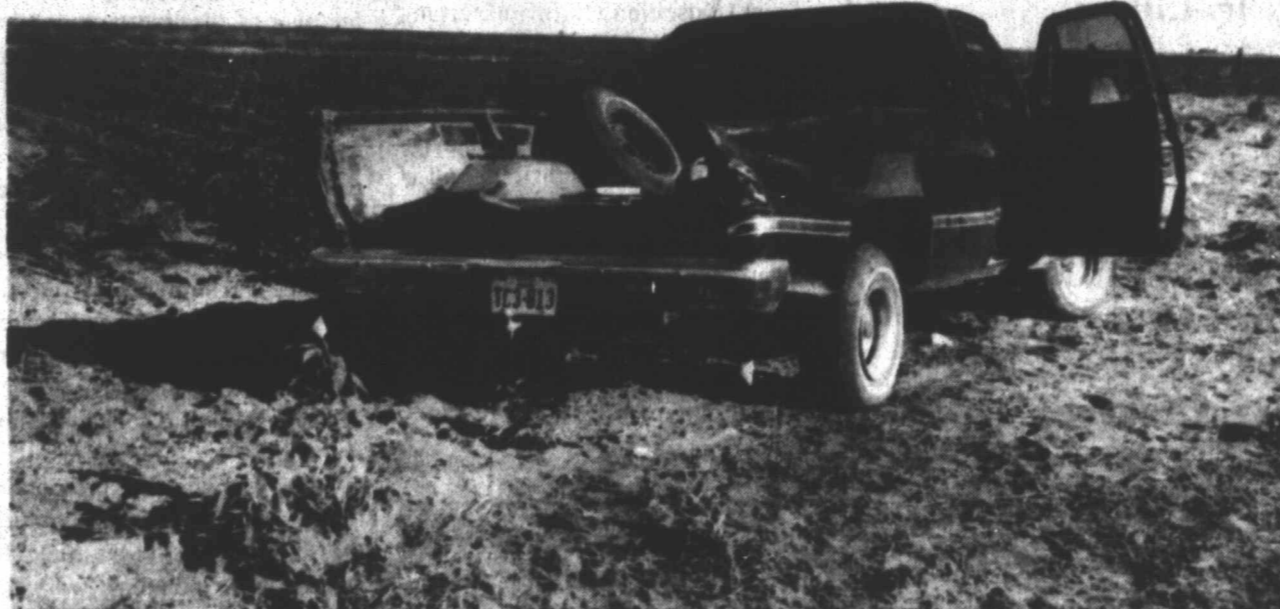
VEHICLES OVERTURN —Two separate one-vehicle accidents were reported in the county during the last two weeks. In the top photo is a 1983 Chevrolet pickup which overturned near New Home, injuring three persons, apparently none seriously. The lower photo is of a Mercury Cougar driven by a Post resident when it overturned on FM 1054 near Draw July 11.