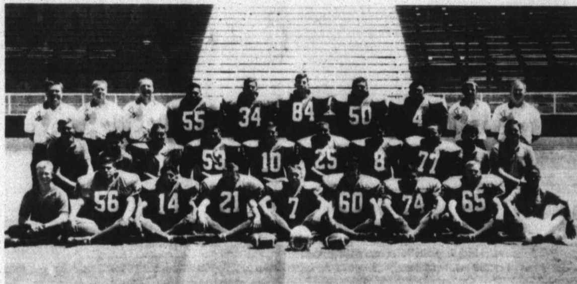
1995 TAHOKA HIGH SCHOOL VARSITY BULLDOGS