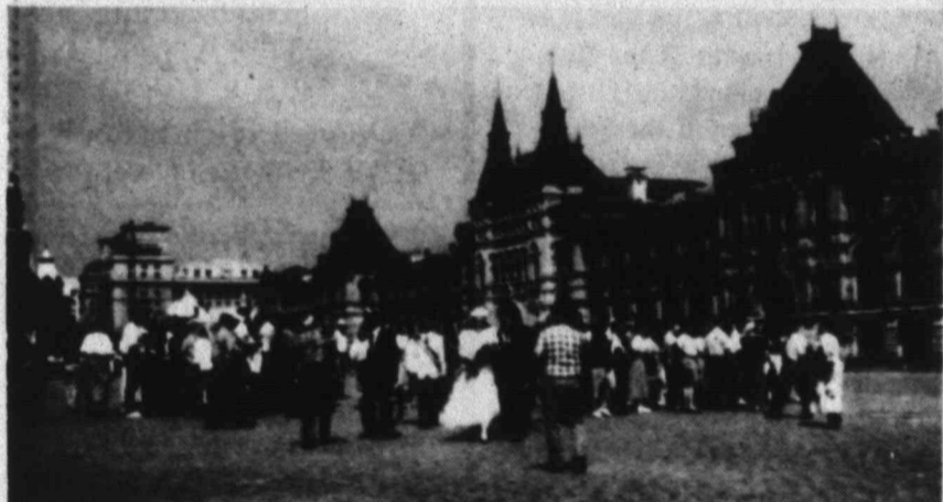
A WEDDING IN RED SQUARE - This photo of the Red Square in Moscow was taken by Jay Jay Wiseman, a member of the Tahoka crusade team, and shows a wedding party there.