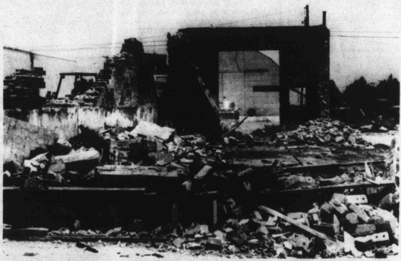
WALLS COMING DOWN - The walls of the Tumbleweed Cafe in downtown Tahoka were about the only thing left standing following a May 8 explosion and fire, and those came down last week as workers pushed them over with a bulldozer. Cleanup was complete by the weekend as the rubble was removed by the truckload. Here, J.C. Clay (in foreground) and another worker toss in bricks and other debris. (LCN PHOTOS)

No? Well, there should be. Write your congressperson ... or your editor ... you can use my kitchen table.