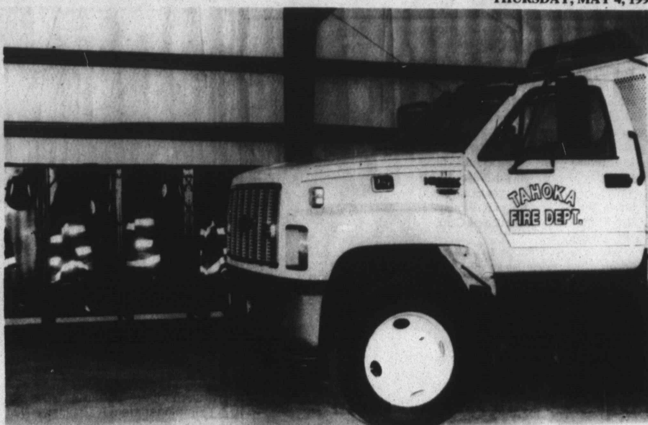
INSIDE NEW FIRE HALL —The new fire hall in Tahoka has been completed, and now houses all six vehicles for the Tahoka Volunteer Fire Department, including one rescue truck, two tankers, a new pumper truck and the old pumper truck, and the van. New lockers inside contain the firefighters' equipment.

Need office supplies? Come to your local Lynn County News 1617 Main Street, Tahoka