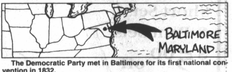
The Democratic Party met in Baltimore for its first national convention in 1832.