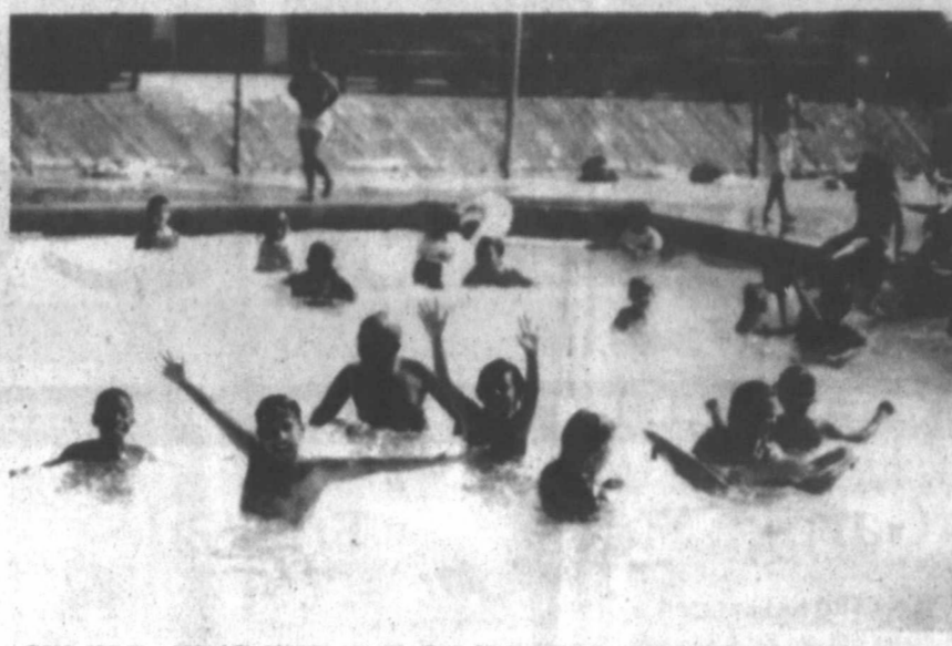
CELEBRATING THE END OF SUMMER SCHOOL- Staff and students involved in the summer school program at Tahoka Elementary celebrated the end of classes with a swimming party at the city pool. Summer school ended the last part of June.

Wilson ISD summer maintenance program continues with several projects to repair and clean up the school property. The two story house, known as the