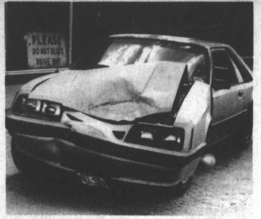
SMASHUP - This 1986 Ford Mustang was involved in a collision with a pickup at Lockwood and Ave. K Saturday. There were no injuries.

The Opry Musical will begin at 7 p.m. until 11 p.m. or 12 p.m. There will be a wide range of entertainment, country, blue grass, gospel, and more country.