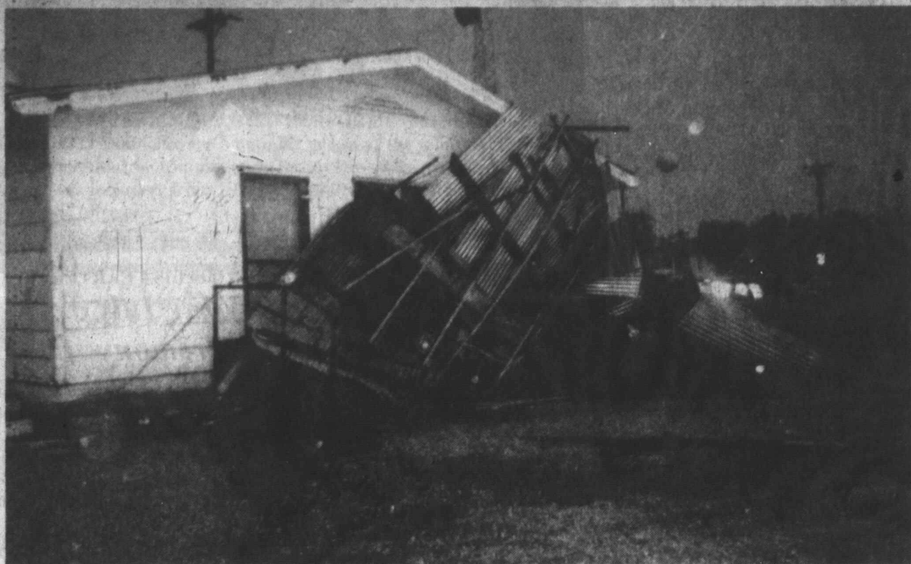
STORM DAMAGE IN NEW HOME —New Home residents received some unwanted storm damage along with up to six inches of welcome rain last Tuesday evening. These photos, taken by David and Imelda Willis, owners of the Wagon Wheel Restaurant in New Home, were taken at about 7:30 p.m. following what some residents considered a tornado. The top photo shows the back side of the Wagon Wheel Restaurant, where pieces of Charles Smith's metal garage were blown up against the back. Windows were shattered and the back wall was cracked at the restaurant, and glass and debris were scattered inside the restaurant, causing them to close for at least a day to clean the debris. The photo below shows Smith's building and several New Home residents who gathered immediately following the storm to help clear debris. Other minor roof and window damage was reported in town.

VOLUME 90, NUMBER 27 • TAHOKA, LYNN COUNTY, TEXAS • THURSDAY, JULY 8, 1993 • 6 PAGES IN ONE SECTION PLUS INSERTS