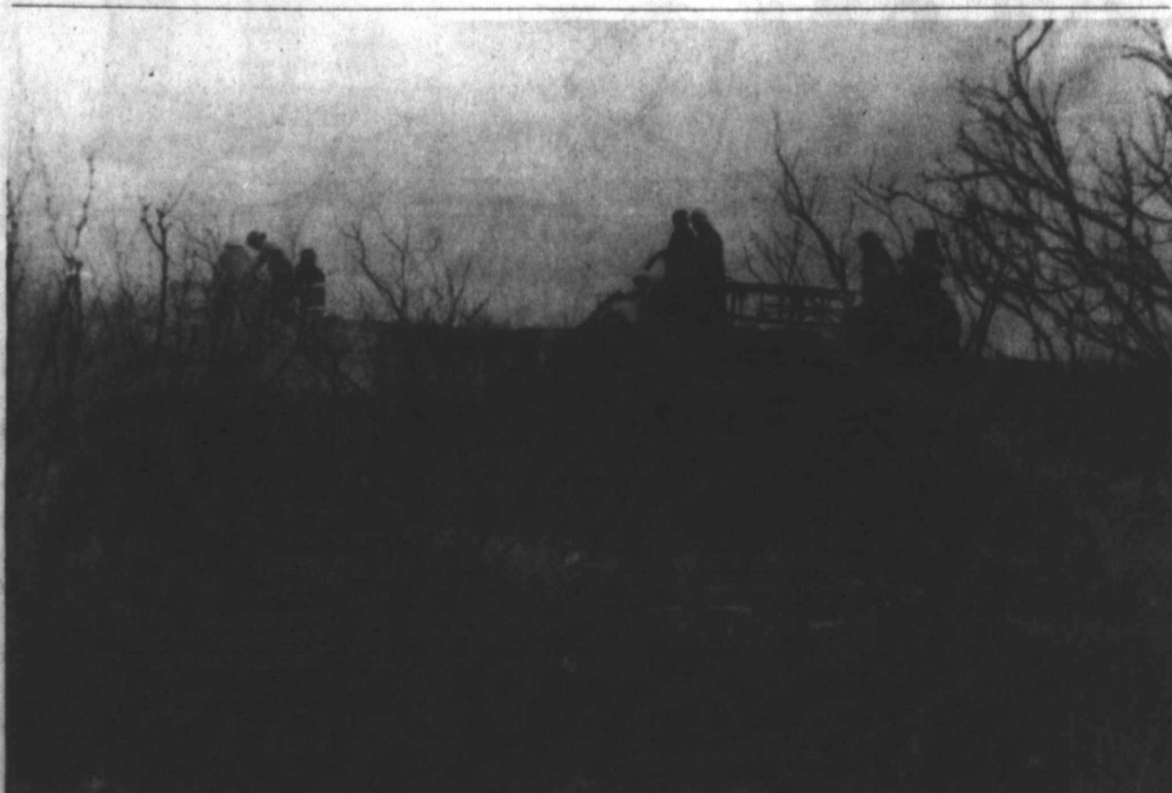
LOTS OF SMOKE AND FIRE - This major rangeland fire on T-Bar Ranch southwest of Tahoka was contained by Tahoka Volunteer Fire Dept. late Tuesday afternoon.

Transfer forms are available in the Superintendent's office in the Tahoka High School building.