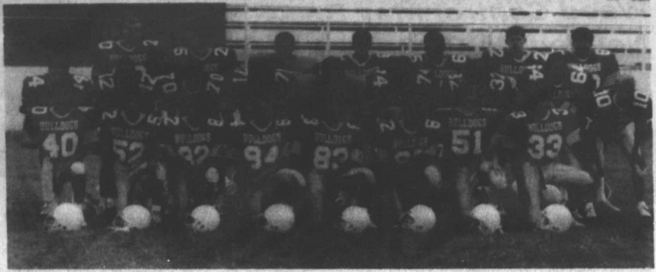
THE 1992 TAHOKA JUNIOR VARSITY BULLDOGS