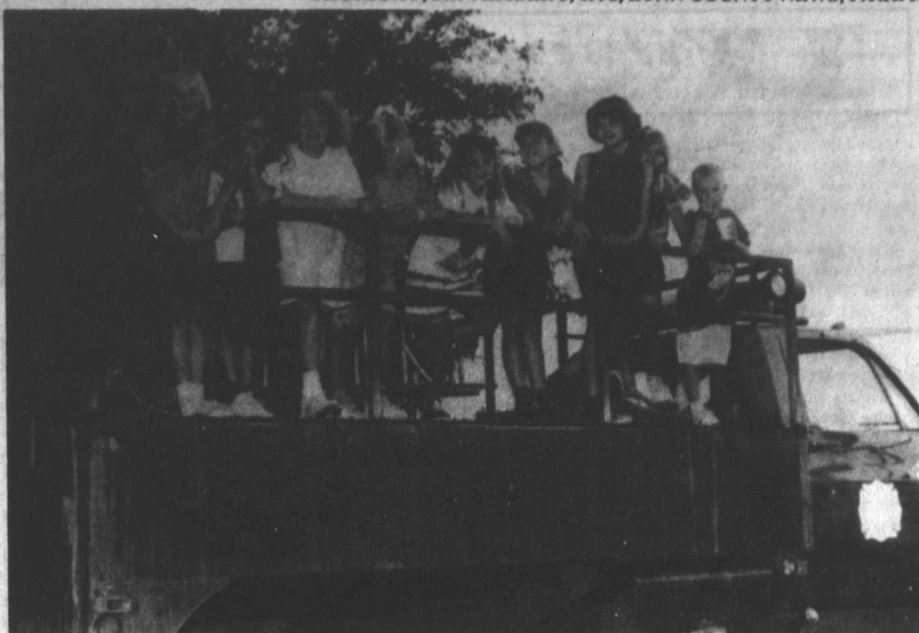
FUN ON THE FIRE TRUCK - These youngsters enjoyed climbing up on the old firetruck at the annual Firemen's Fish Fry event Saturday evening.