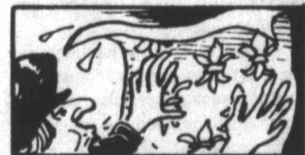
Scholars believe the first wallpaper was made in Europe during the 1500's.