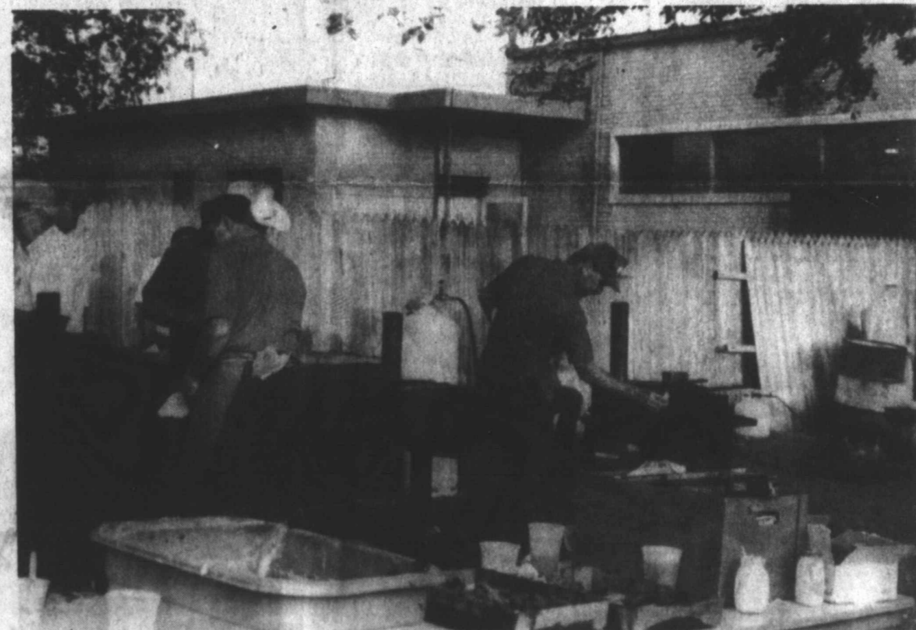
FRYING UP FISH - Members of the Tahoka Volunteer Fire Dept. worked Saturday evening frying up fish and fries for their annual fundraiser. A good crowd turned out for the event.