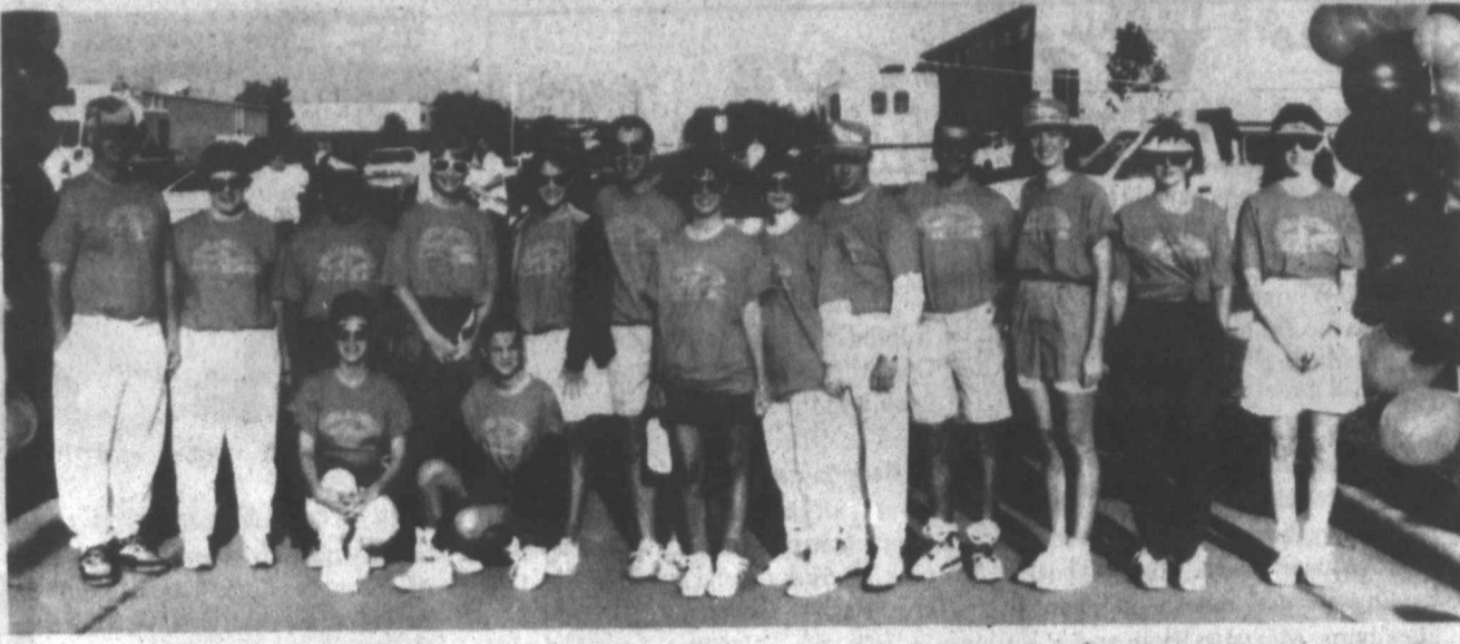
POKA-LAMBRO WALKERS - Several Poka-Lambro employees joined the March of Dimes Annual Teamwalk/Walk America event held in Lubbock recently. The group raised over $1,000 at the fundraiser.

This workshop will focus on dealing with grief in children, youth and adults, and the public is invited to attend. There will be no admission charge, and families with children of all ages are encouraged to attend.