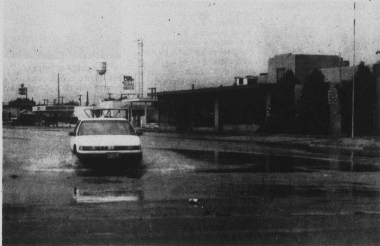
RAINY DAYS - About two inches of rain fell in downtown Tahoka last Friday, filling up intersections with several inches of water, as shown at this intersection of Main and Lockwood. Some Tahokans reported receiving as much as three inches of rain during the week. Officially, Tahoka received 2.09" for the week, bringing the yearly total to 10.66".