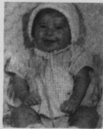
from your nieces & nephew