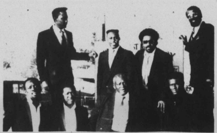
SPIRITUAL SOUL SEEKERS will be performing at the Wilson City Park, in Wilson Friday, Aug. 2, beginning at 7 p.m. There will be barbecue sandwiches, cakes, pies and drinks for sale with all proceeds going to the group to help with the purchase of a van. The singing group has performed for eight years in parts of Texas, Oklahoma and New Mexico.

Friday- Roast Beef, Gravy, Potatoes, Carrots, Roll, Fruit Cup, Milk