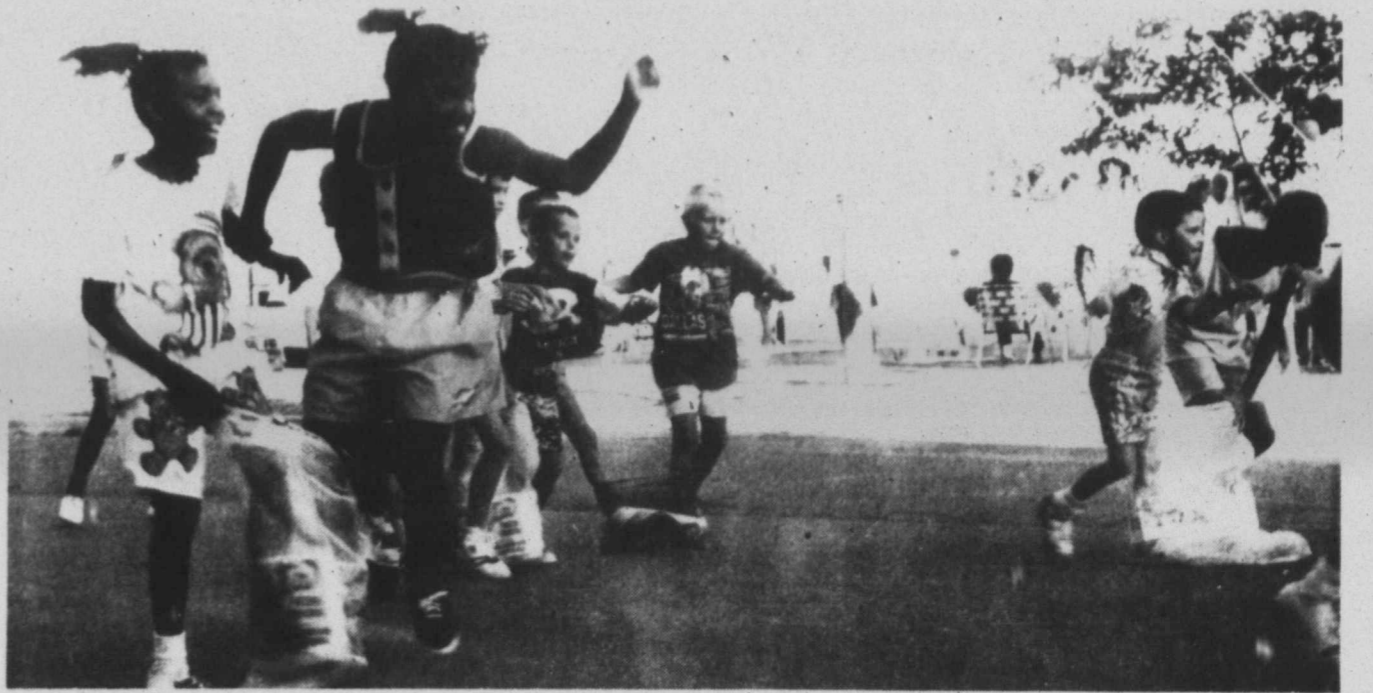
FUN ON THE FOURTH - These youth enjoyed participating in the games at the July 4th Celebration held in Tahoka at the mini-park.

Thursday (today) at 7 p.m. in the board room.